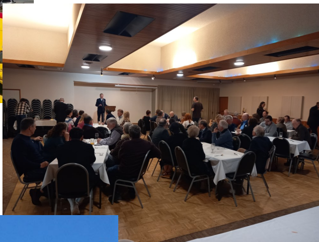
Mid-winter dinner and prize giving 12th August