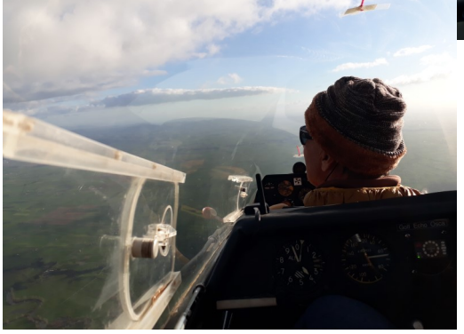
Right—VR, XB and BX flew 300km on the 28th Aug