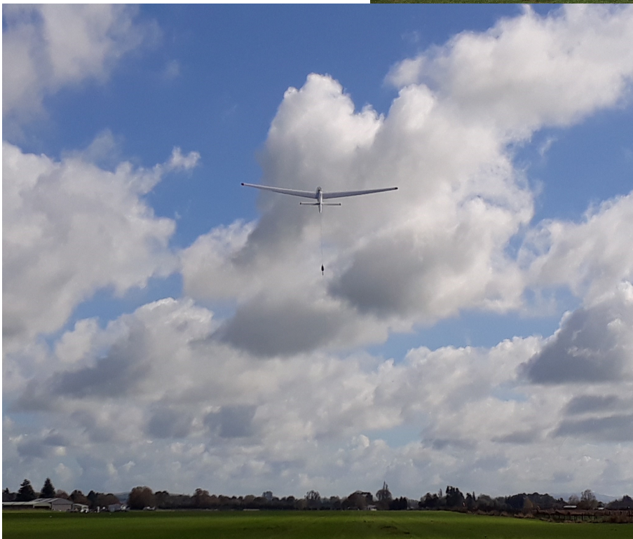
Sunday 20th May