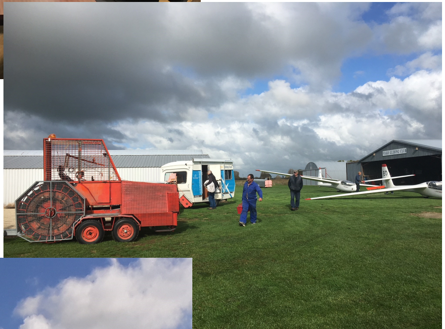
Wed 16th May