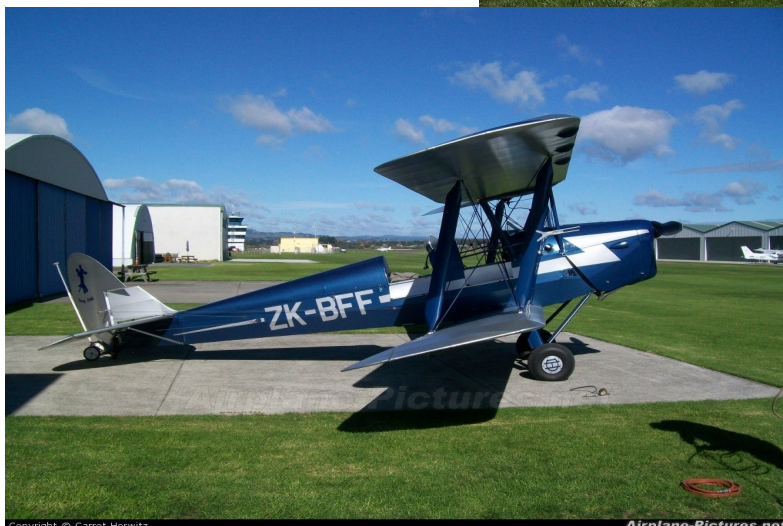
One of Piako's first Tow Plane's. It will around on the 14th and hopefully, doing some vintage towing