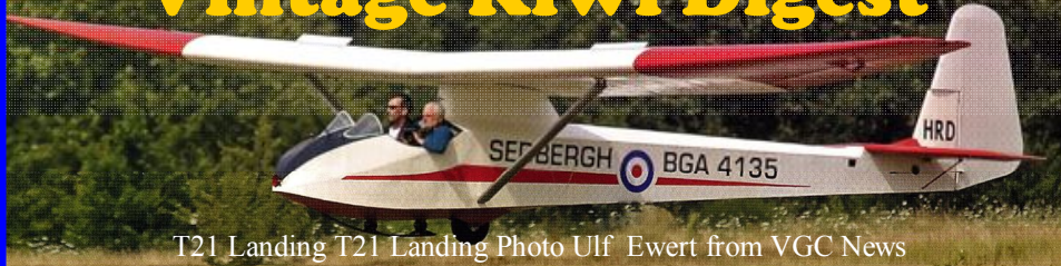
T21 Landing T21 Landing